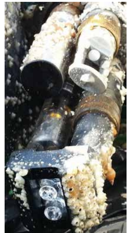
Clean sensor faces after nine months in-situ.