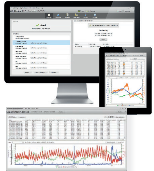
Quickly View Trends

Quickly view the current status of the instrument to ensure proper functionality