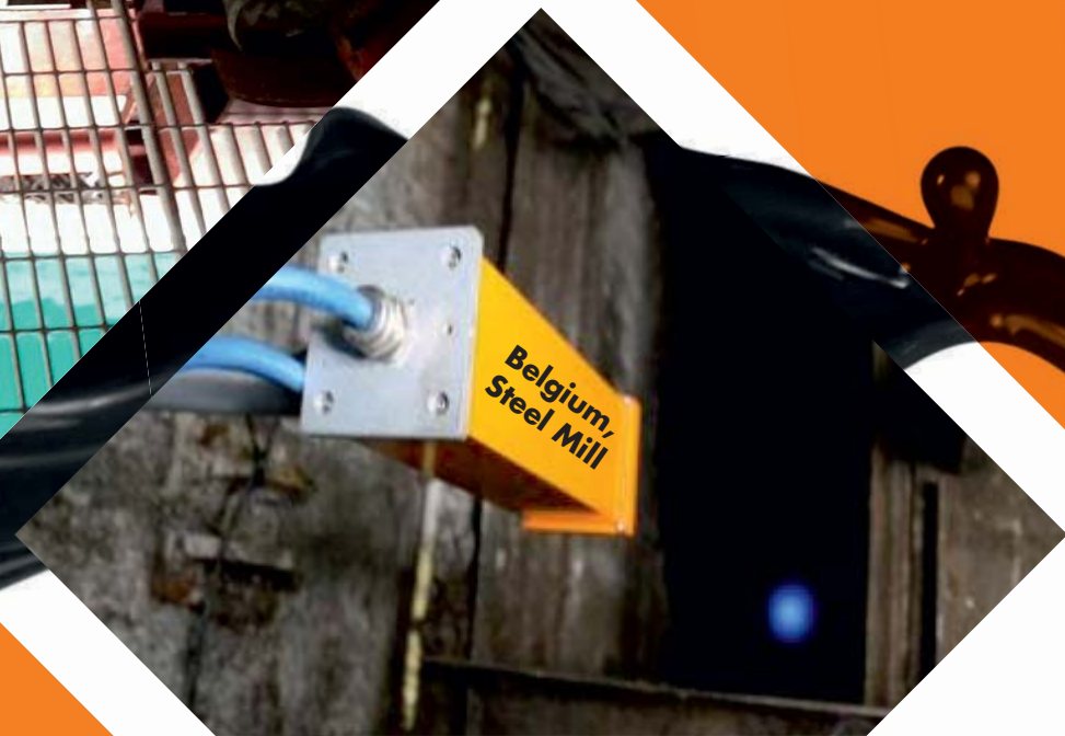
Belgium, Steel Mill