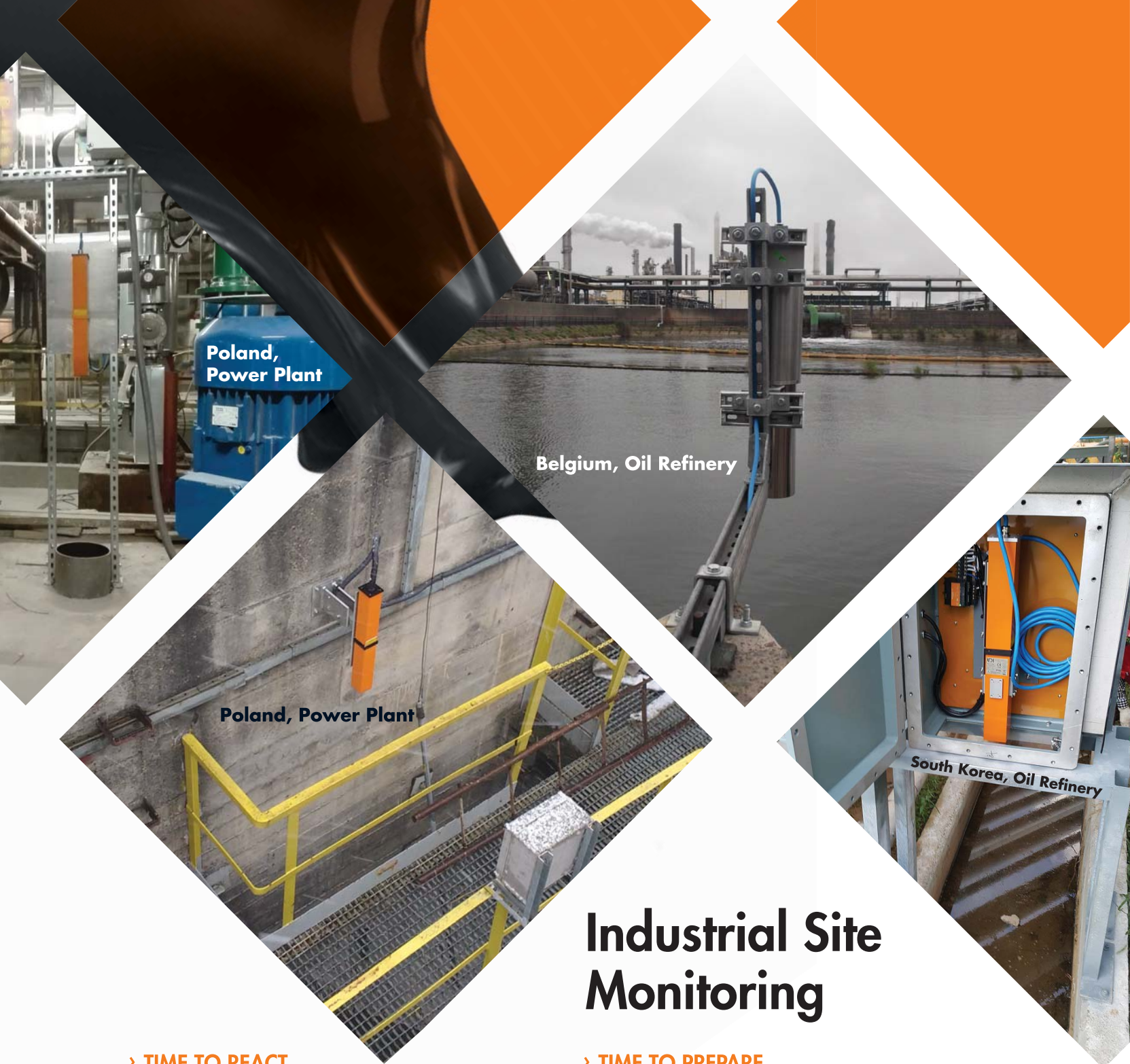
Belgium, Oil Refinery