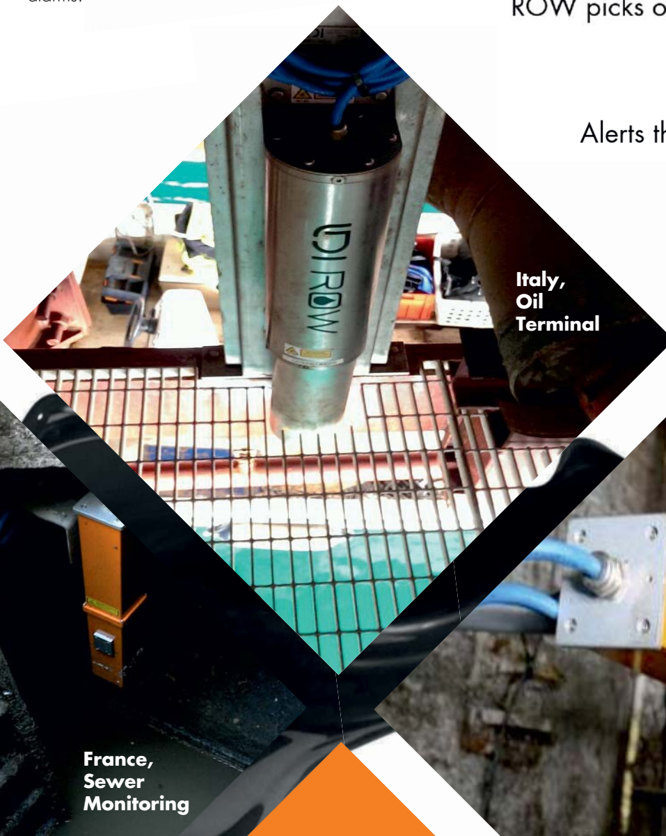
Italy, Oil Terminal